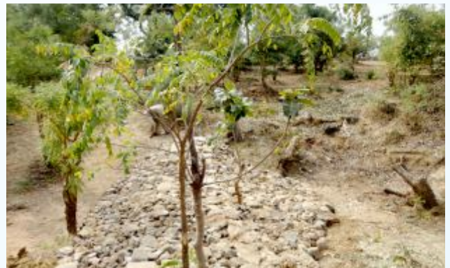
D. Field site in Kachhar village under Bhoura Forest Range