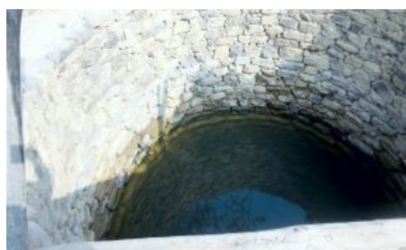
Sources of drinking water in the villages of ESIP area