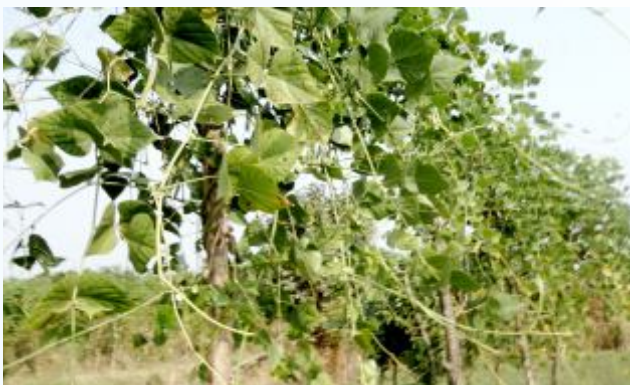
A. Vegetable cultivation in Pipalgota village in Banapura Forest Range