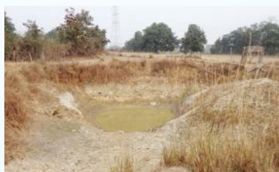
B. Field site of Pipalgota village of Banapura Forest Range