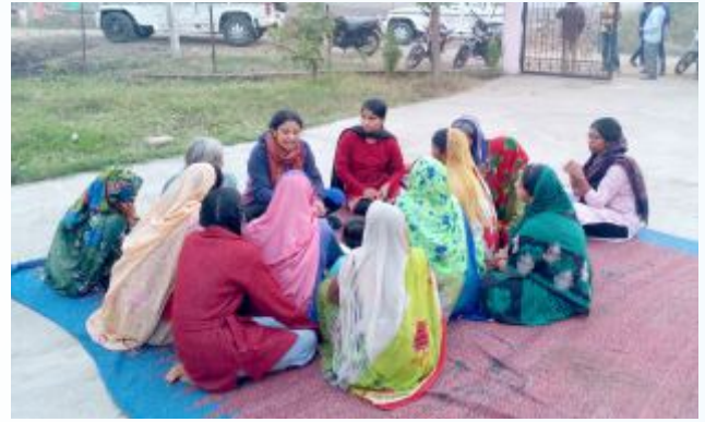
B. In village Akola