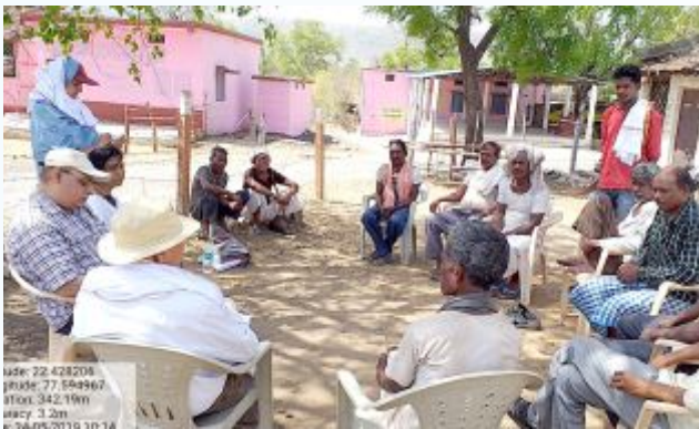
A. In village Sotachikli