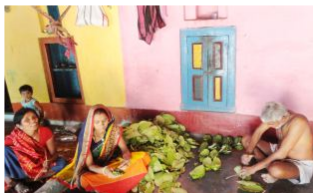
G. Villagers engaged in making bundle of tendu patta in ESIP area