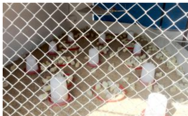
F. Poultry farming practice in Bhoura Forest Range