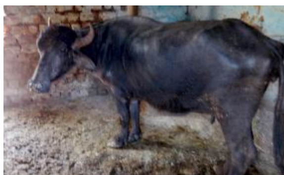
Livestock in the villages of ESIP area