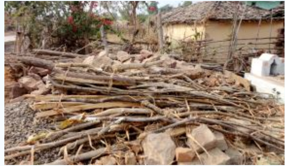
Small timber collection in courtyard for agriculture and household purpose