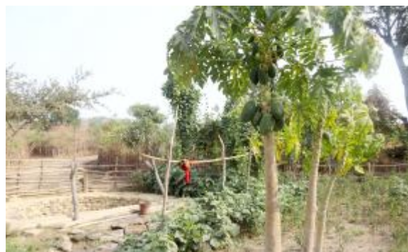
C. Sources of irrigation in villages of ESIP area