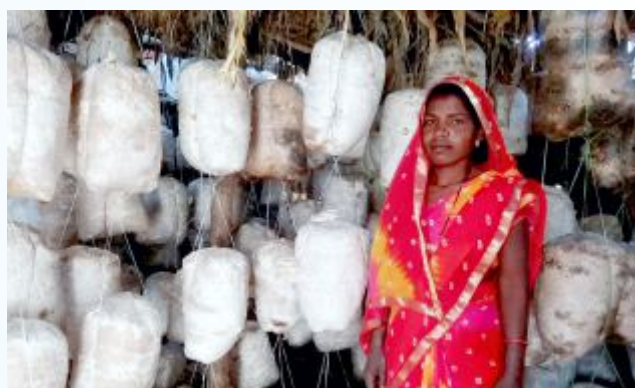
A. Mushroom cultivation in Sukhtawa Forest Range