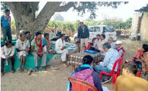
C. In village Pipalgota