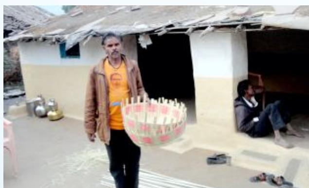
C. Livelihood from Bamboo in Budhni Forest Range