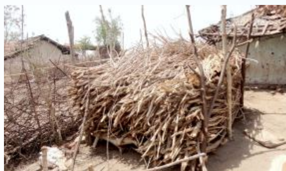
Fuelwood collection and storage in the villages of ESIP area