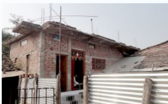
C. Pucca house