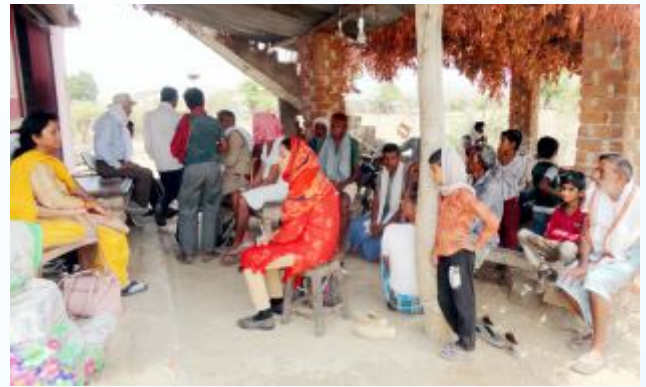
D. In village Kachhar

Focus group discussion with villagers during socio-economic survey