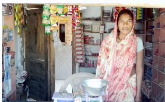
B. Women engaged in shop keeping in Bhaura Forest Range