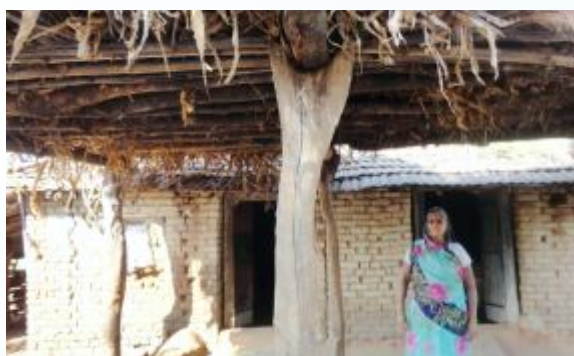
B. Semi-pucca house