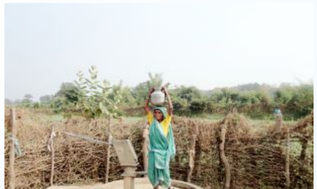
B. Source of drinking water in Banapura Forest Range