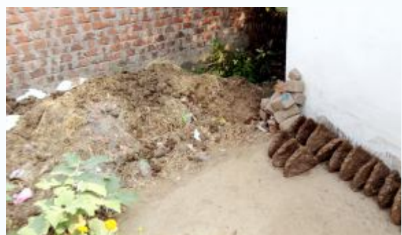
Household waste management in the villages of ESIP