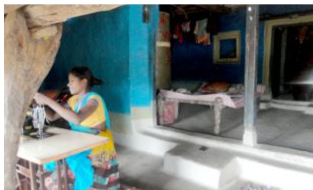
E. Woman engaged in tailoring in Banapura Forest Range