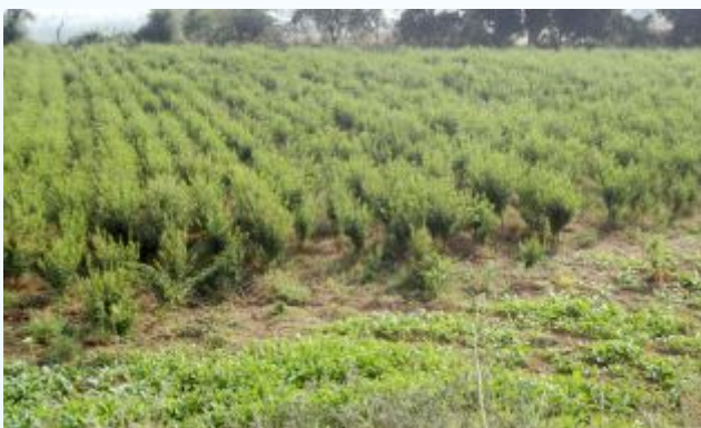
C. Arhar cultivation in Khatpura village under Budhni Forest Range