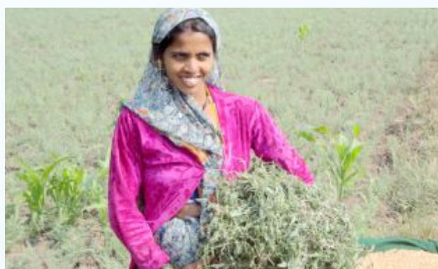
D. Women farmer in Budhni Forest Range