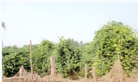
Crops and vegetables cultivated in the villages of ESIP area