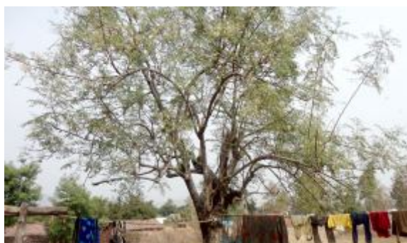
Horticulture and agroforestry practices in the villages of ESIP area