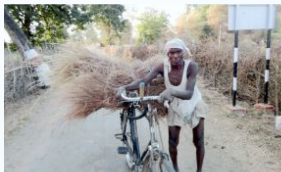
Fodder collection and storage in the villages of ESIP area