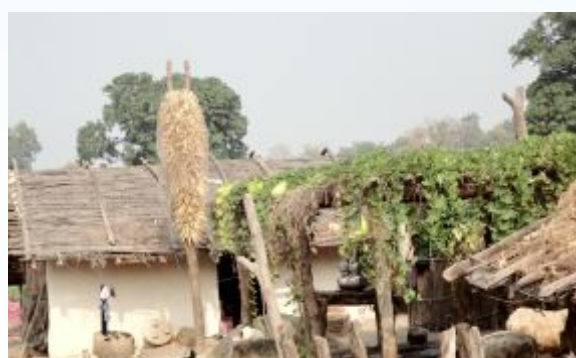
Storage of maize seed