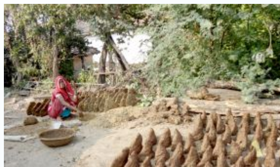
Dung cake: A source of energy for cooking and heating in ESIP villages